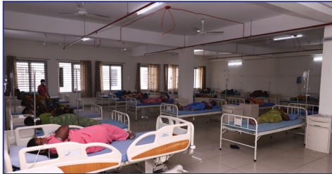
IN-PATIENT WARD – 1000+ BEDS