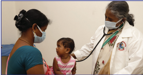
CONSULTATION – 2500+ OPD