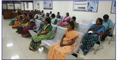
MASTER HEALTH CHECKUP