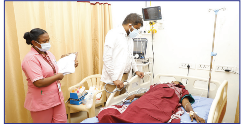
ICU – 110 BEDS