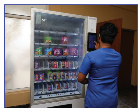
Snack Vending Machine